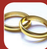
August 11-13 Retrouvaille for Married Couples For stressed or troubled marriages.