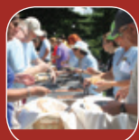
June 11 Malvern Family Festival