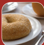
August 4 First Friday Breakfast