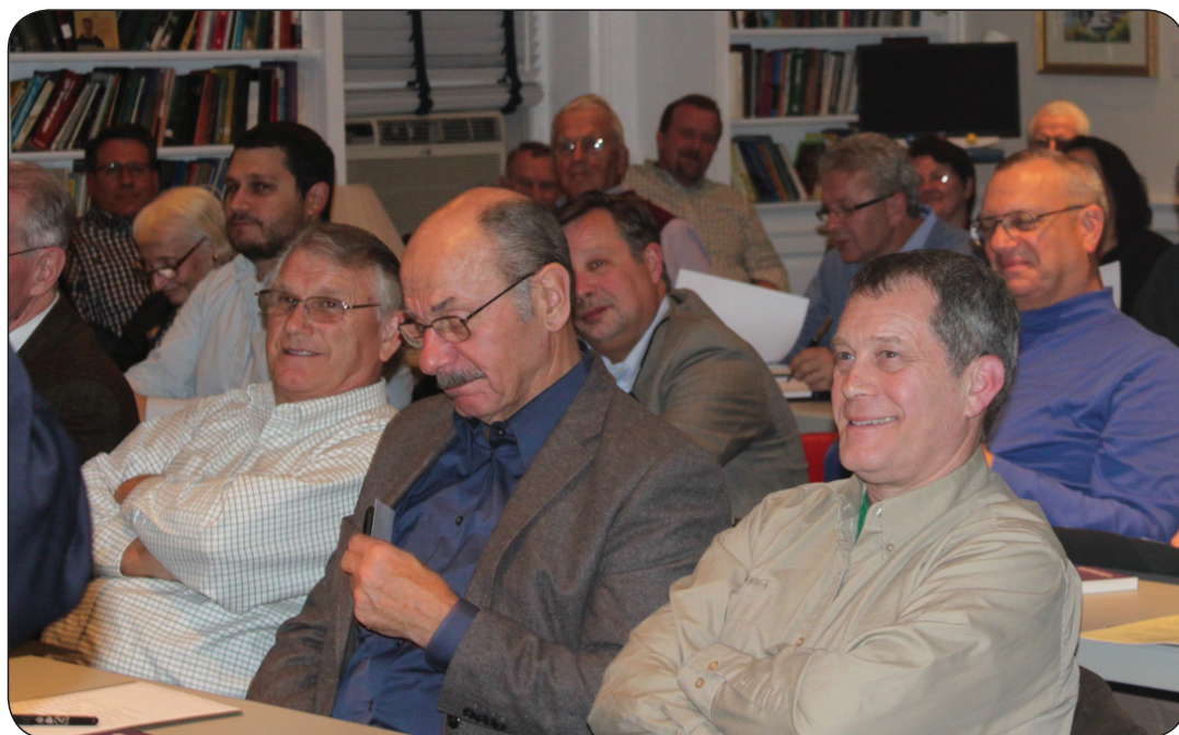
Retreat captains relax as they listen to various speakers during the Annual Captains Conclave.