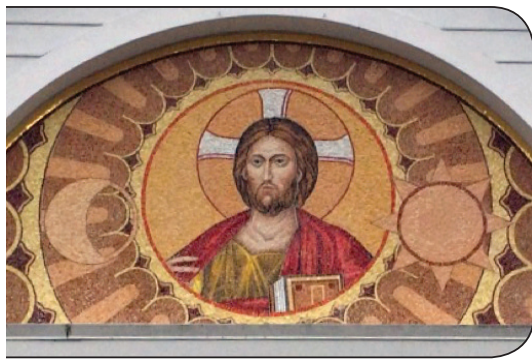
A new mosaic adorns the entryway of the McShain-Horstmann Family Life Center.

A beautiful Christ Pantocrator mosaic has been installed above the entrance of the McShain-Horstmann Family Life Center. Pantocrator is Greek, meaning "Ruler of All."