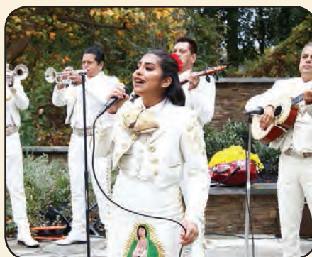
The group Mariachi Flores performed many traditional Mexican songs at the Our Lady of Guadalupe shrine dedication ceremony.