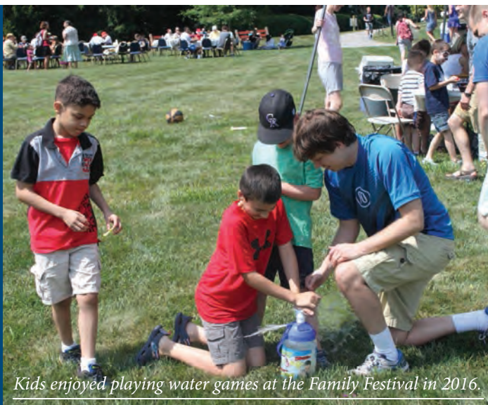
Kids enjoyed playing water games at the Family Festival in 2016.

More details will be available in the near future at malvernretreat.com .