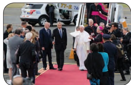
Pope Francis arrived at Philadelphia International Airport on September 26, 2015.

It can surely be said that Philadelphia literally rolled out the Red Carpet for Pope Francis. One friend of Malvern has donated a section of the red carpet that his Holiness stepped on as he disembarked from his plane at Philadelphia International Airport. A section of the carpet is going to be displayed outside of each of our chapels and in the lobby of Upper McShain. On your next retreat, spend a few moments in quiet contemplation while remembering Pope Francis' historic visit to the city of Brotherly Love.